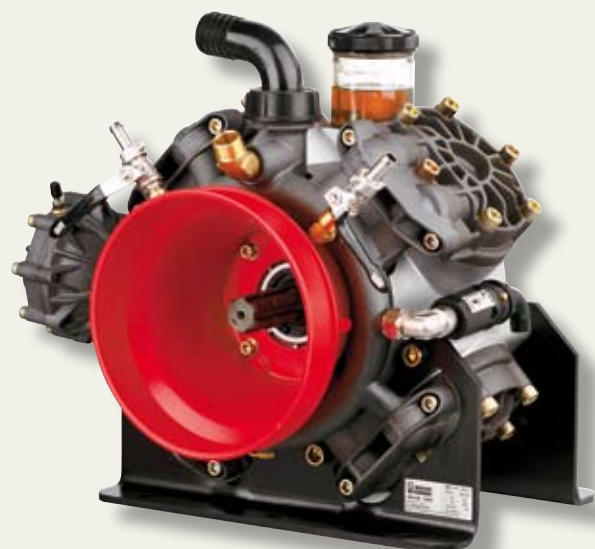
BHA 170 BHA 200