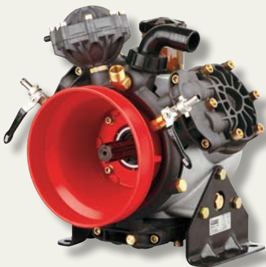
BHA 130 BHA 150