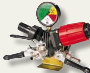
RM 20 S AR 70bp÷AR115bp