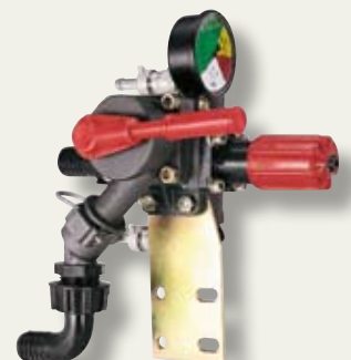
VDR 20 S AR 70bp÷AR135bp