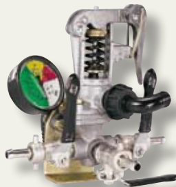
GS 20 S AR 70bp