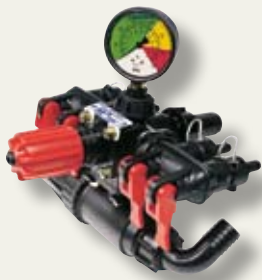
ECM AR 70bp÷AR160bp