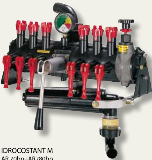
IDROCOSTANT M AR 70bp÷AR280bp