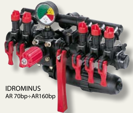
IDROMINUS AR 70bp÷AR160bp